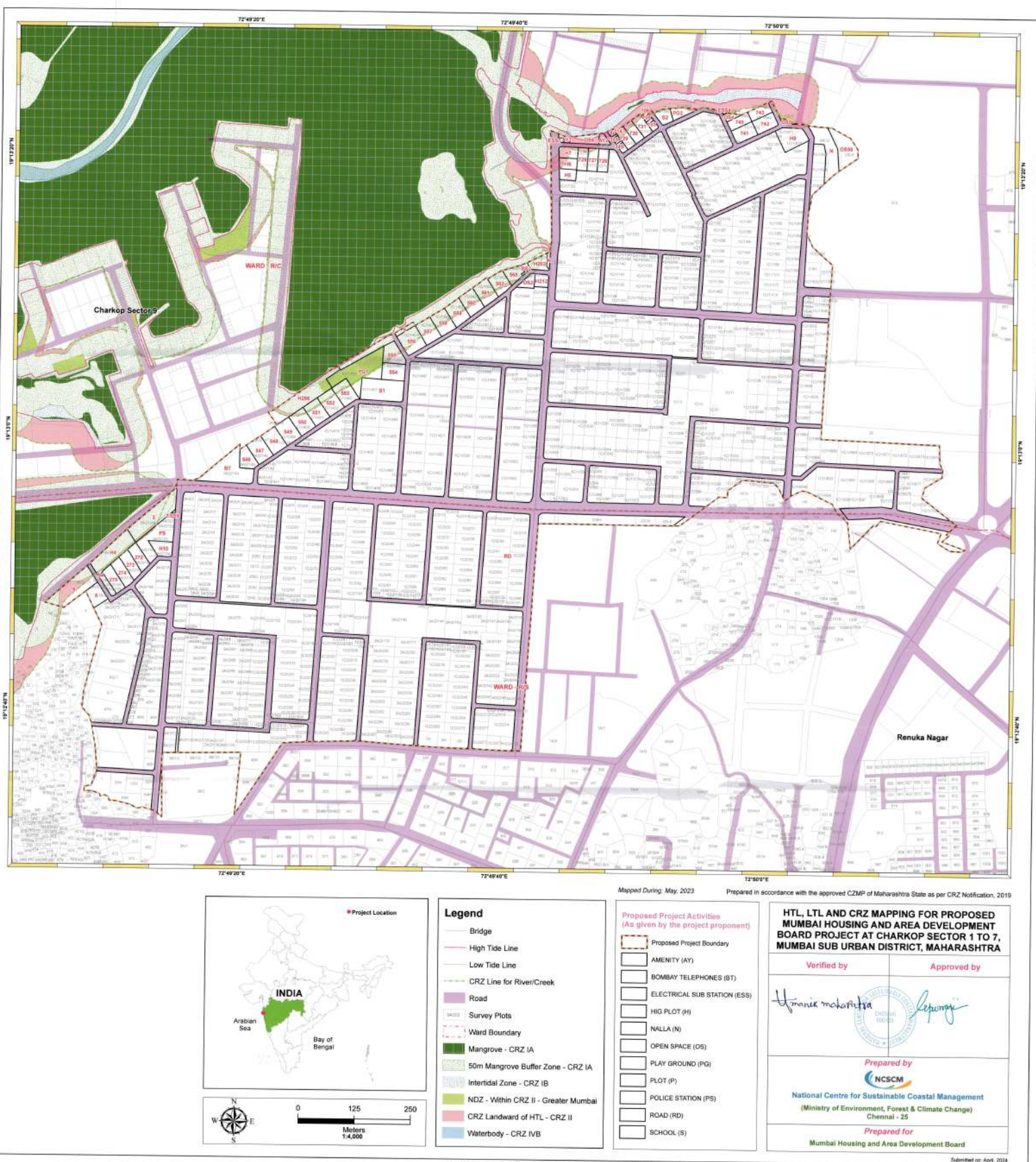
Figure 2. CRZ Map of the proposed project site (Refer Report No. NCSCM/CRZ-Cell/CRZ-4/04/2024/23)