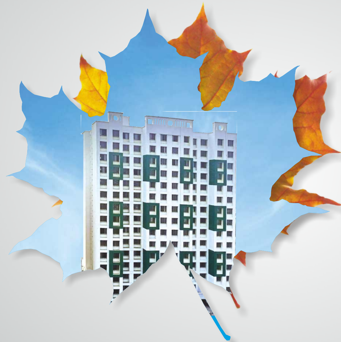
2 BHK MIG BUILDING