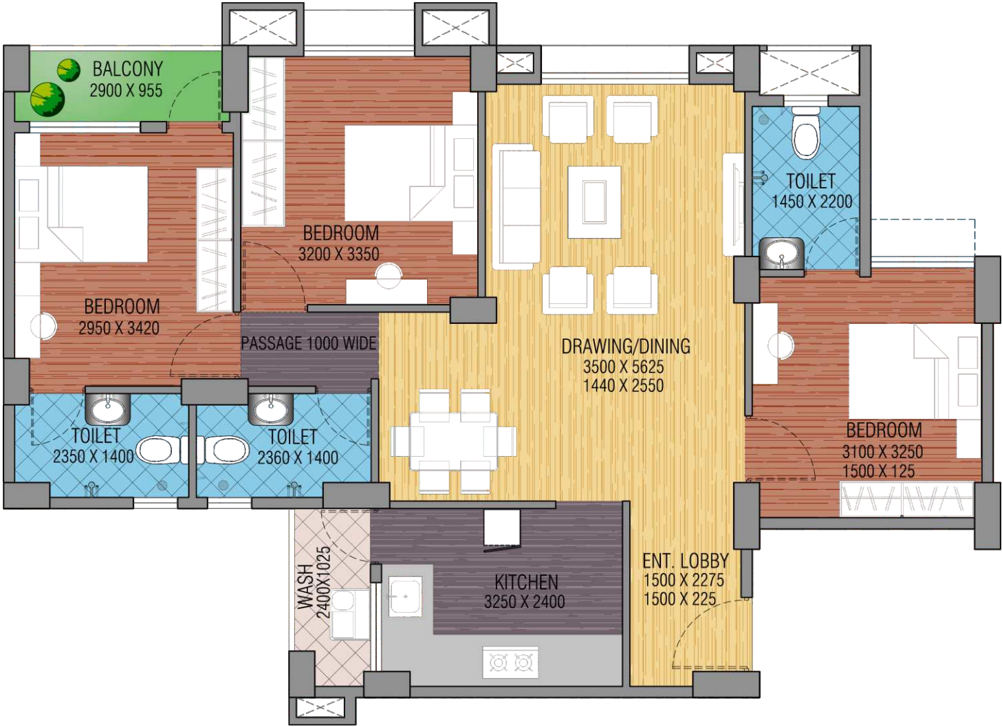
Unit Plan along with area and Cost Details