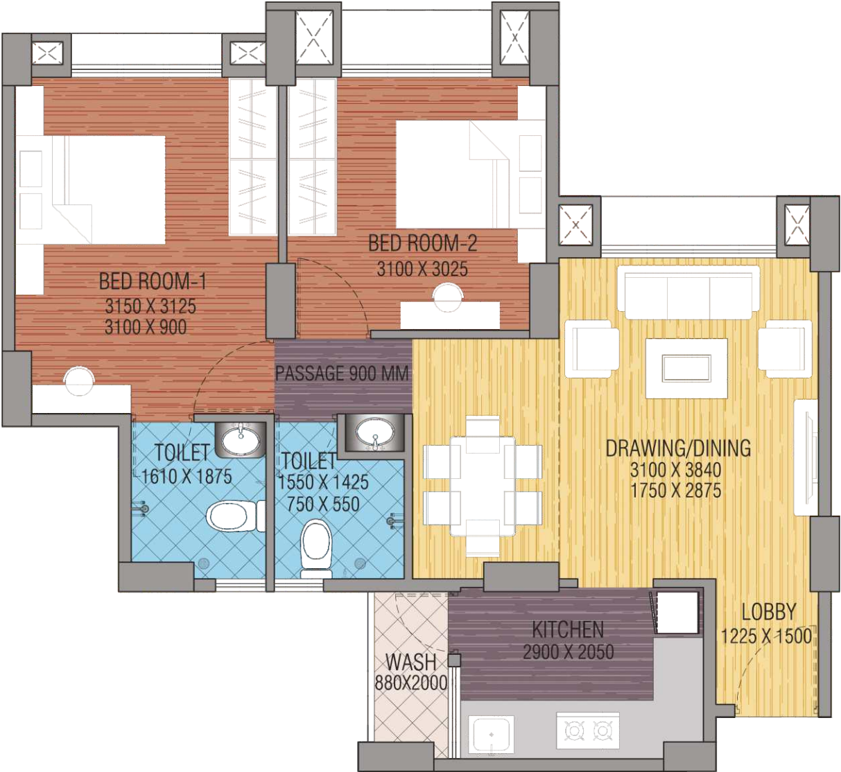
Unit Plan along with area and Cost Details